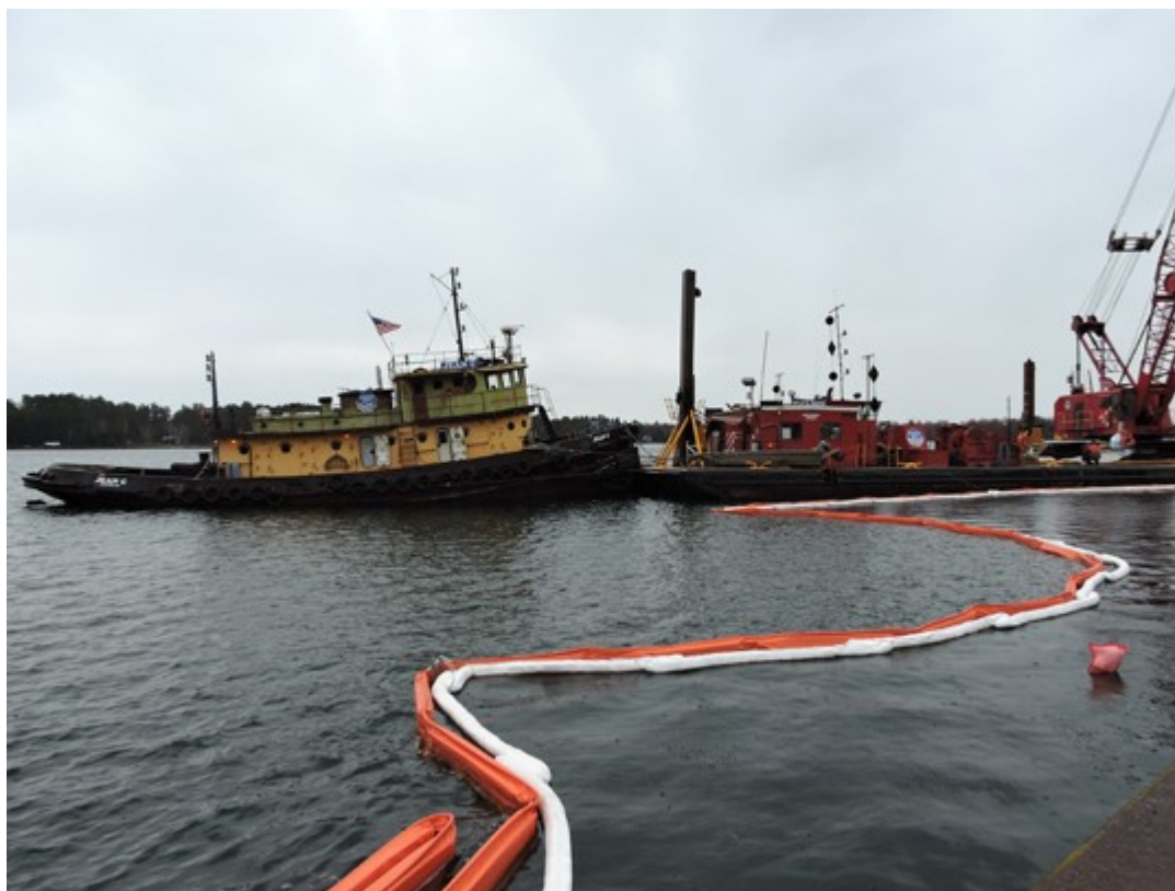
Containment booms surround leaking petroleum from the sunken Katherine while a recovery barge and the tug Jean C. raise the Dawn Tuesday in the Lower Entry.